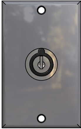
Key Switch Front View